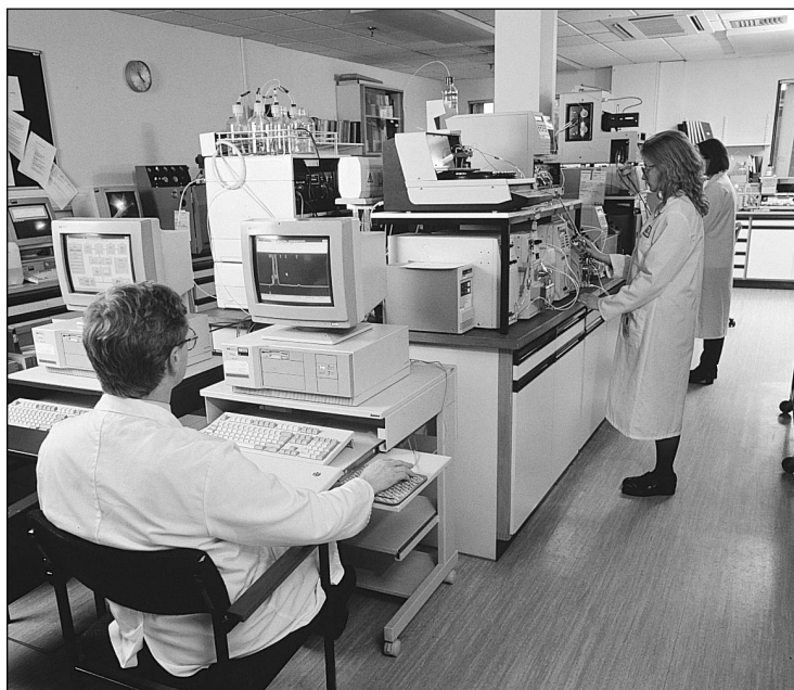
One of the many labs, this one in Zug, Switzerland, which participate in the GNLD Global Science Network.

As Science progresses and even accelerates, you can continue to depend on GNLD to remain a primary driving force in the global marketplace.