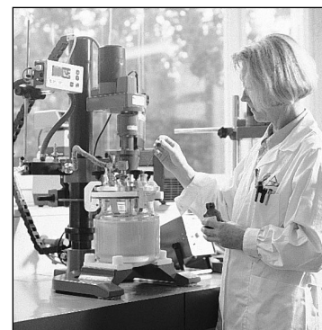
A technician in the GNLD European Technology Center in Ferney-Voltaire, France, performs a quality-assurance test.

As science progresses and even accelerates, you can continue to depend on GNLD to remain a primary driving force in the global marketplace. We're setting the pace for the industry. And while our competitors scramble to catch up, GNLD will continue to set performance records with innovative and peerless products.